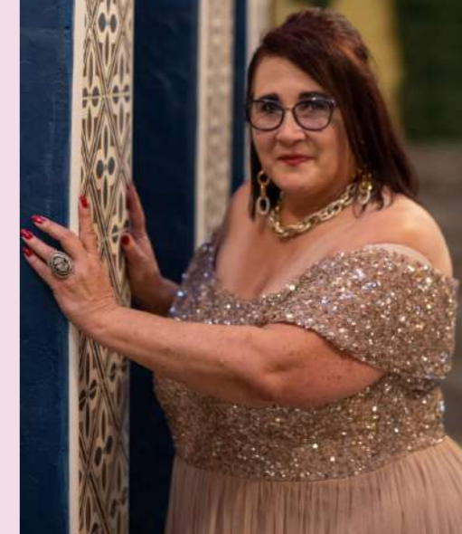
Venue: Bar with No Name - Village