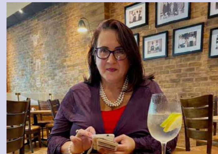
Venue: Turn & Tender Vaalmall

Back page: Our next Issue is our April 2025 Issue.