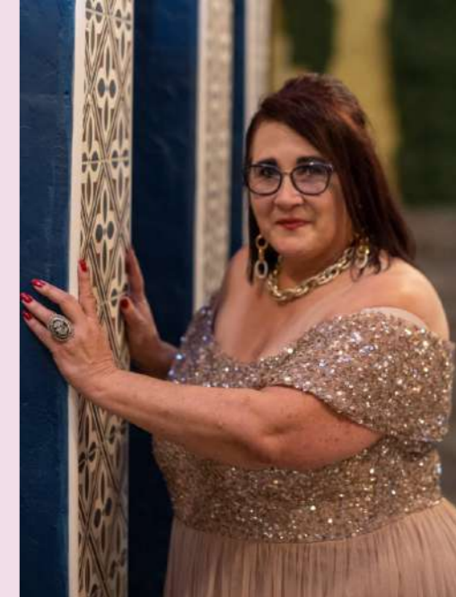
Venue: Bar with No Name - Village

Back page - our next issue is our March Issue