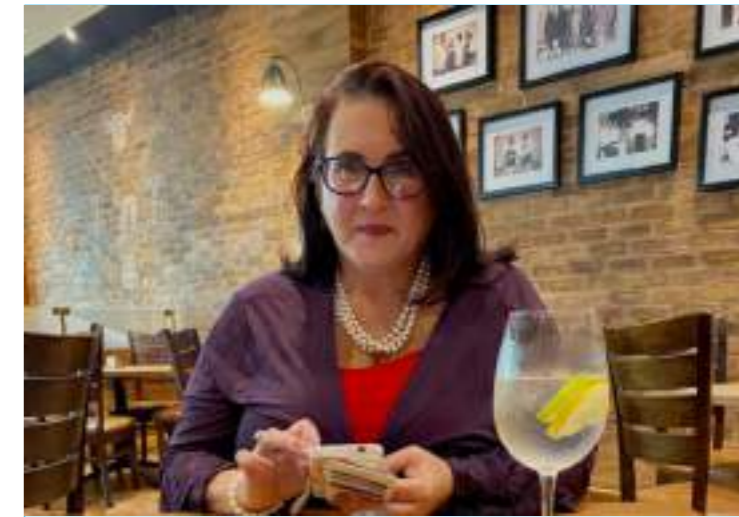
Venue: Turn & Tender Vaalmall

Back page: Our next Issue is our APRIL Issue.