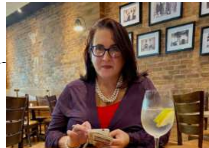
Venue: Turn & Tender Vaalmall

Back page: Our next Issue is ou December month issue.