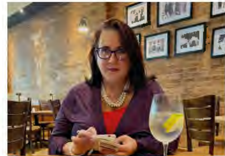
Venue: Turn & Tender Vaalmall

Back page: Our next Issue is October month