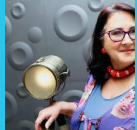
Venue: Photo Diary & Venue