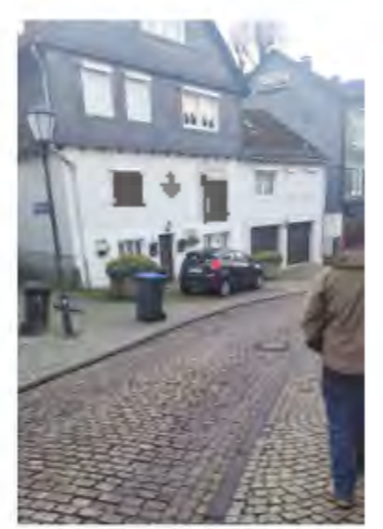
The photo's above, is basically the look of the town they don't have garages to park the cars or let me rephrase not all the house comes with garages cars are mostly park outside the house exactly like the photos shows.