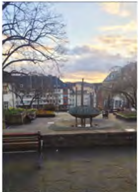
The photo to the side is part of the old town or as they call it Altstadt von Siegen, this is looking down about halfway to the top where the upper castle is