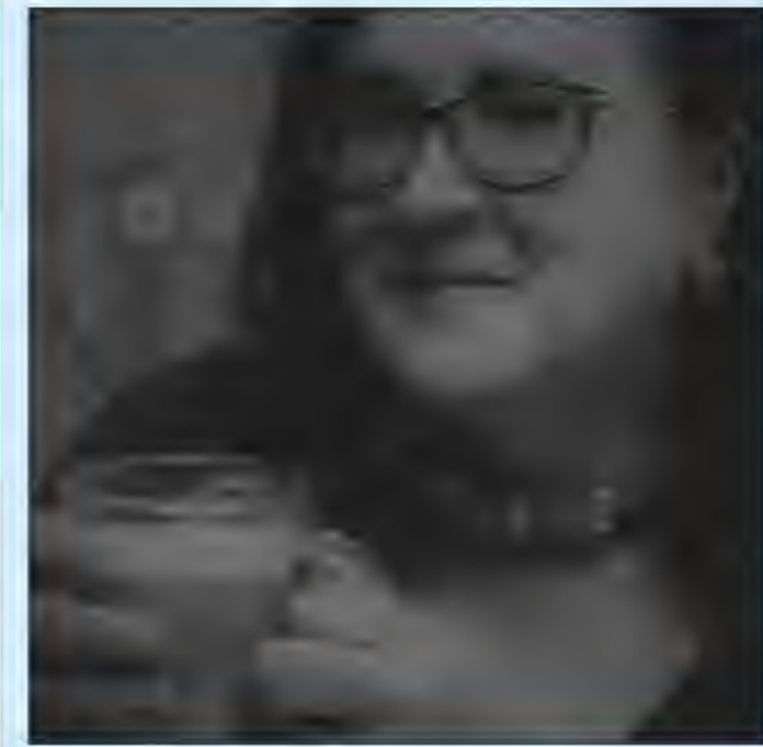
Venue: Photo Diary & Venue.

Back page: Our next Issue is April - Easter