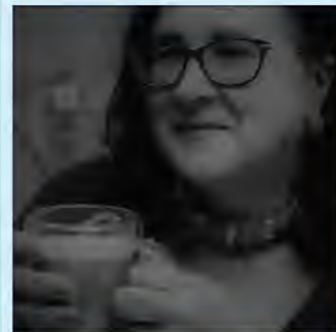
Venue: Photo Diary & Venue.

Back page: Christmas decorations -our next Issue is January 2023.