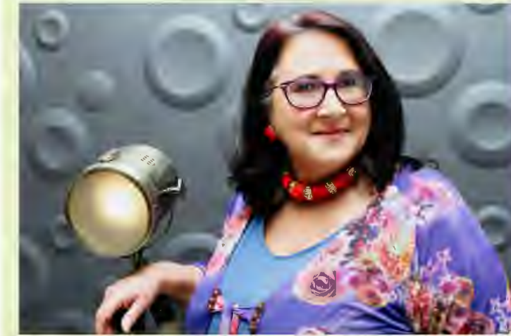
Venue: Photo Diary & Venue