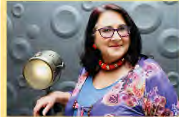
Venue: Photo Diary & Venue