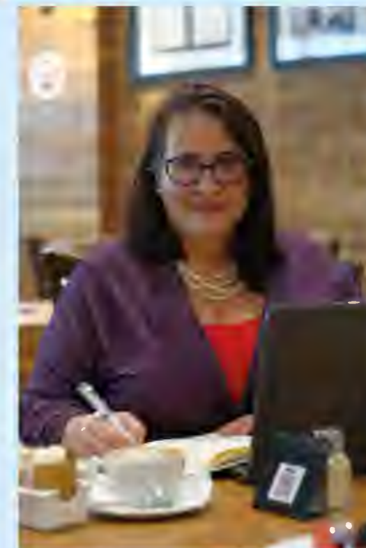
Venue: Turn 'n Tender - Vaal mall