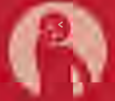
Gquma umlomo wakho ngethishu xa ukhohlela okanye xa uthimla, wakugqiba uyilahlele emgqomeni.

Ukuba unokugulana okungephi, zigcine ngokusela amanzi, uhlale ekhaya uphumle.