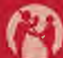
Ukungasondeli kubantu abagulayo