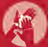
Ukuhlamba izandla rhoqo

Okwa ngoku akukabikho chiza likhoyo ukukhusela nokuthintela abantu ekusulelweni yintsholongwane COVID-19. Ukunwena kwayo kuncitshiswa ngoku: