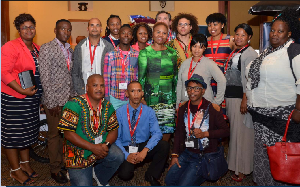
Minister of Small Business, Lindiwe Zulu, with start-up entrepreneurs during the AHi congress

The recently held AHi Congress was a turning point for the organisation's role in enterprise development in South Africa. Sixteen start-up entrepreneurs from all over South Africa attended the congress which was held at the Sibaya Conference Centre in Durban. They were selected from more than 600 entrepreneurs throughout South Africa who attended the AHi's entrepreneurial programme for start-up entrepreneurs.