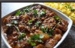
Curry Lamb + Rice