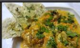
Butter Chicken Bake