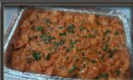
Creamy Cajun Chicken