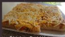
Chicken Roti Wraps