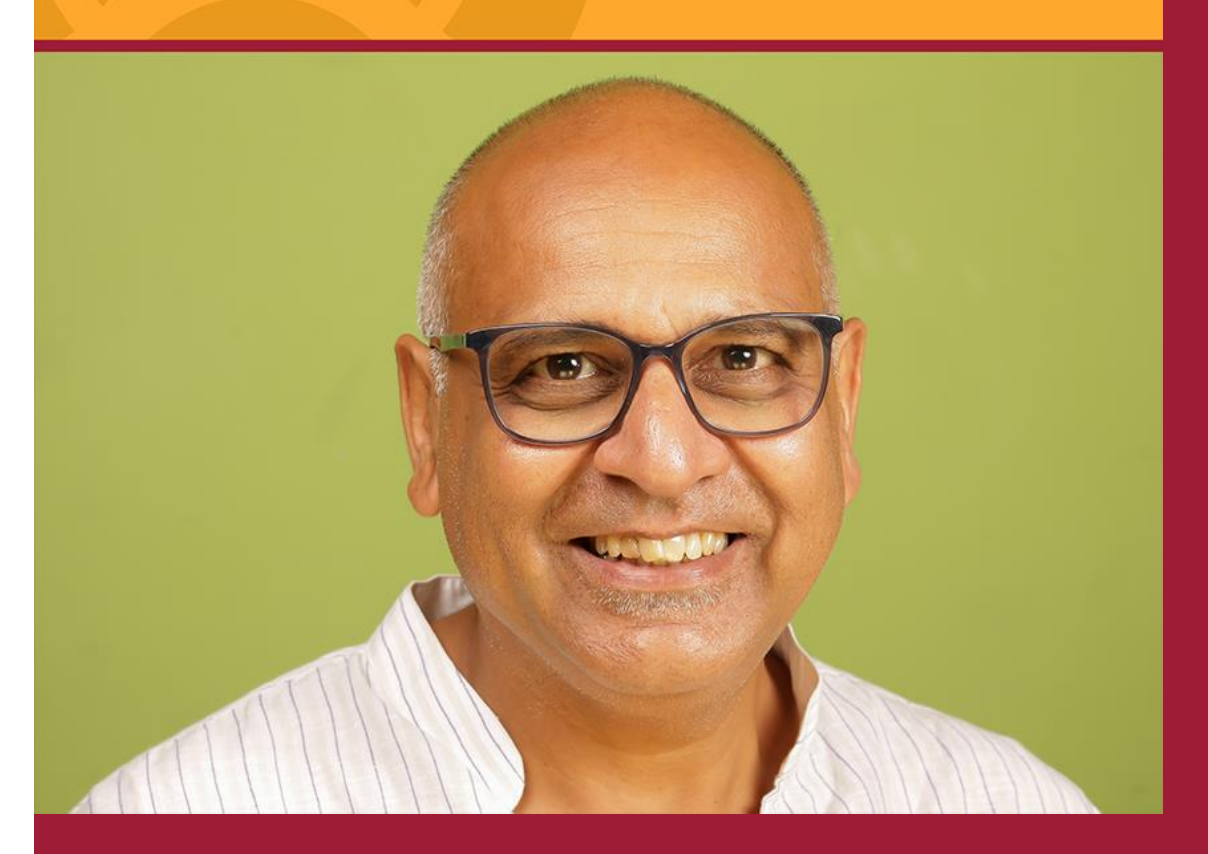
Looking For Hope In Dystopia

In addition to working as a marine geophysicist, my son volunteers as a wildfire fighter. Recently they were called out to assist late at night to deal with a controlled burn that went out of control. The volunteers in charge described what to expect and provided instructions on how to fight the fire based on that knowledge. When they got to the infernal pine forest it was not burning as expected, but worse. He described the situation as those of Californian wildfires - dystopian. Read more