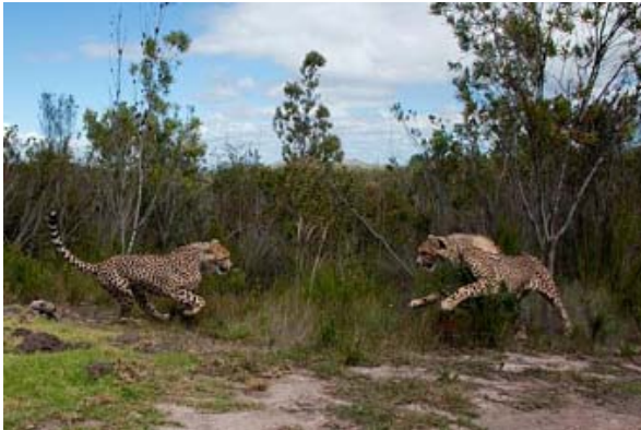
Chaka and Thandi stretching their legs

August has absolutely flown away with us. Although quiet on the tourist front, our rehab has been busy as you can see from the stats with 17 new admissions to the hospital in August. Snorkey made the headlines with his release into Amakhala. He has been kept in a boma until now, but now it's the big world for him. Here's a link to the article in The Herald - he looks happy to be back where he belongs.. Snorkey story