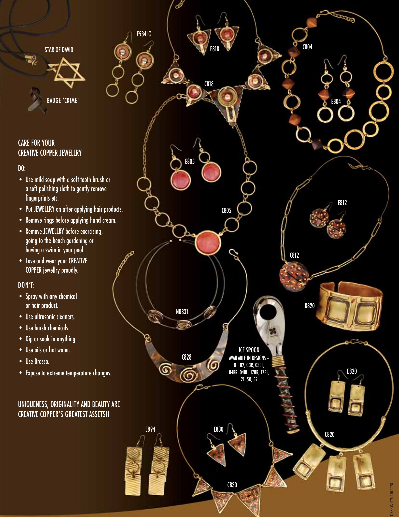
STAR OF DAVID