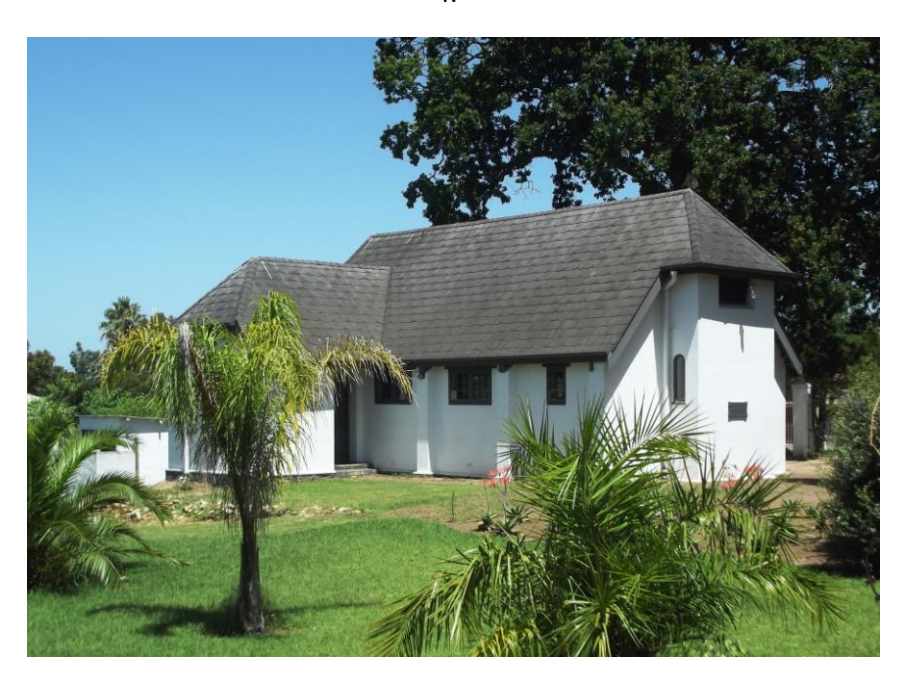
The chapel in Blanco in 2014

It is probably purely coincidental that a near neighbour of C.R. Haw, and a fellow Anglican, was Monty White. One can only speculate as to whether he and Pilkington were aware of the litigation between their families some 60 years previously.