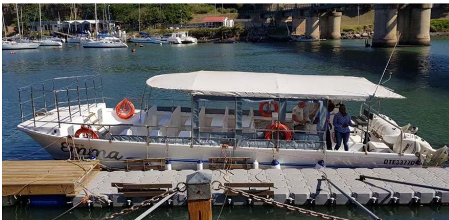
THE SPIRIT OF EMMA